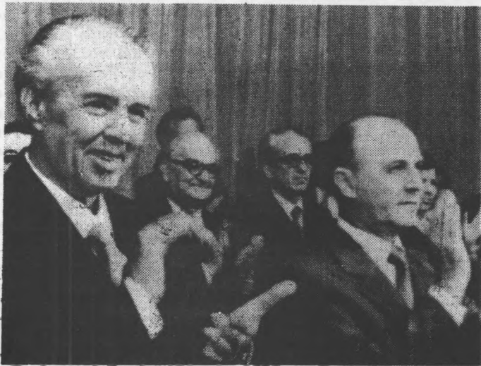
Enver Hoxha and Ramiz Alia in 1983 on Karl Marx Centenary.