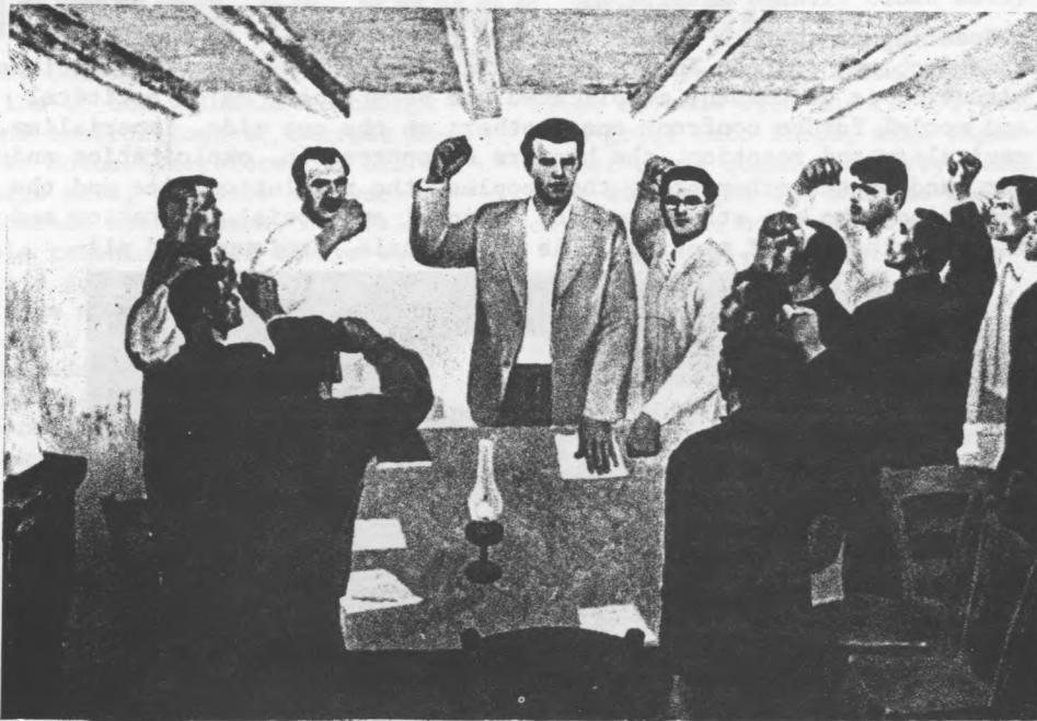
from "The Party Has Been Founded." oil painting by S. Hysa

At the 8th Congress of the Party, Comrade Enver Hoxha stated: "No problem, simple or complicated, present or future, can be solved without the leadership of the Party. This has always been and remains a law. This leadership guarantees the successful construction of socialism, ensures the centralized direction for the sole aim of all the work which is done in the country. It blocks the road to the possibility of the