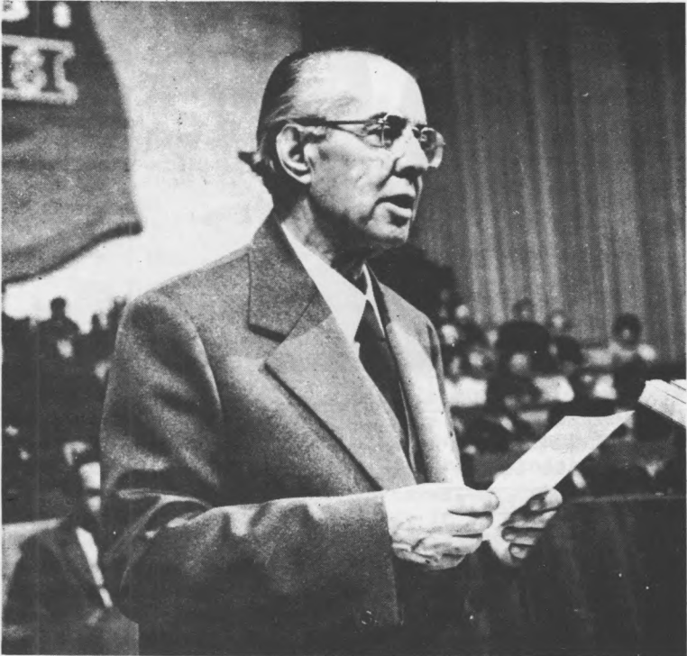
Comrade Enver Hoxha delivers the Report on the Activity of the Central Committee of the Party of Labour of Albania, at the 8th Congress of the PLA on November 1, 1981.

Speaking at the 8th Congress of the Party of Labor of Albania on this problem, Comrade Enver Hoxha said: "...the present international situation is disturbed, complicated and very tense. Major political and social forces confront one another: on the one side, imperialism, capitalism and reaction, the bearers of oppression, exploitation and war, and on the other side, the peoples, the revolutionaries and the democrats, who are struggling for national and social liberation and the emancipation of mankind. This large-scale, profound and all-